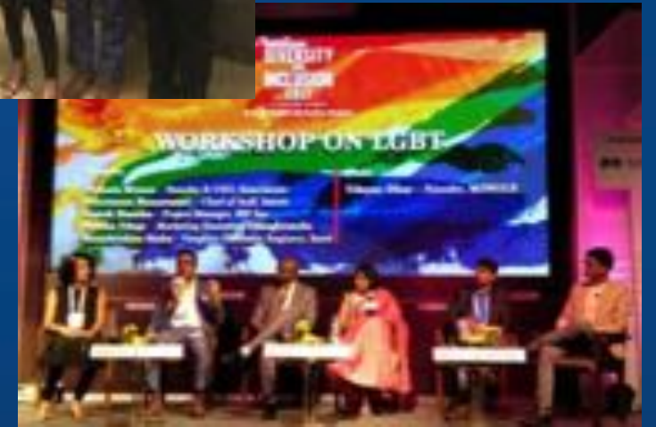
NASSCOM D&I Summit 2017