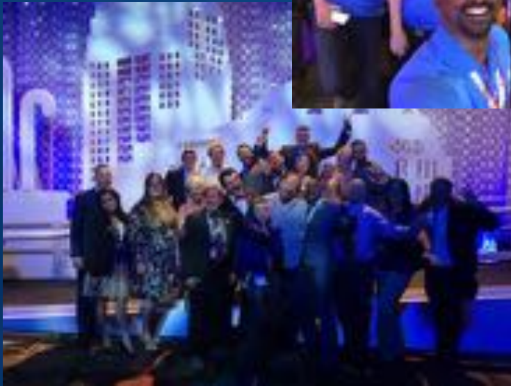
Out & Equal 2016