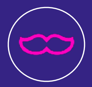
Setting the Stage

How an Employee Resource Group made a big change in the cultural conversation at Lyft